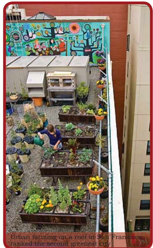
Urban farming on a roof in San Francisco, ranked the second greenest city